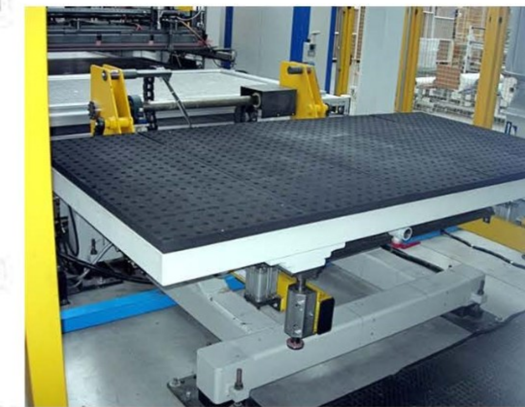
TURNER DEVICE 180°