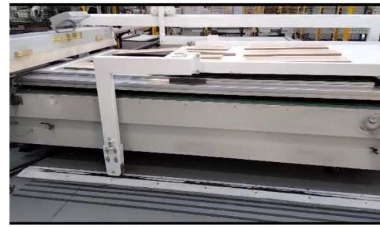
AUTOMATIC LOADING SYSTEM FOR KITCHEN DOORS SITTEX MOD. SIT_LUS