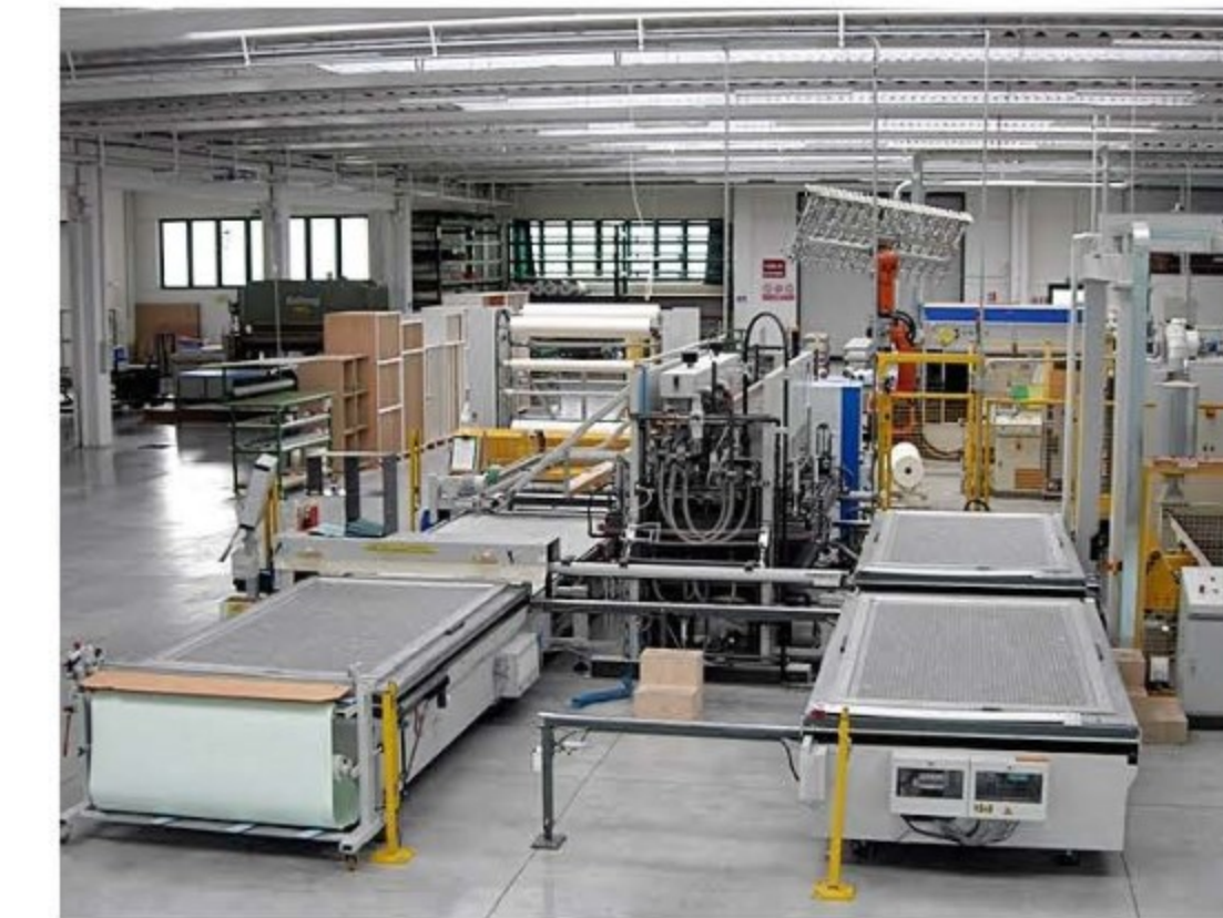
MEMBRANE PRESS WEMHONER VARIOPRESS 2000 MOD. KT-15/28-240